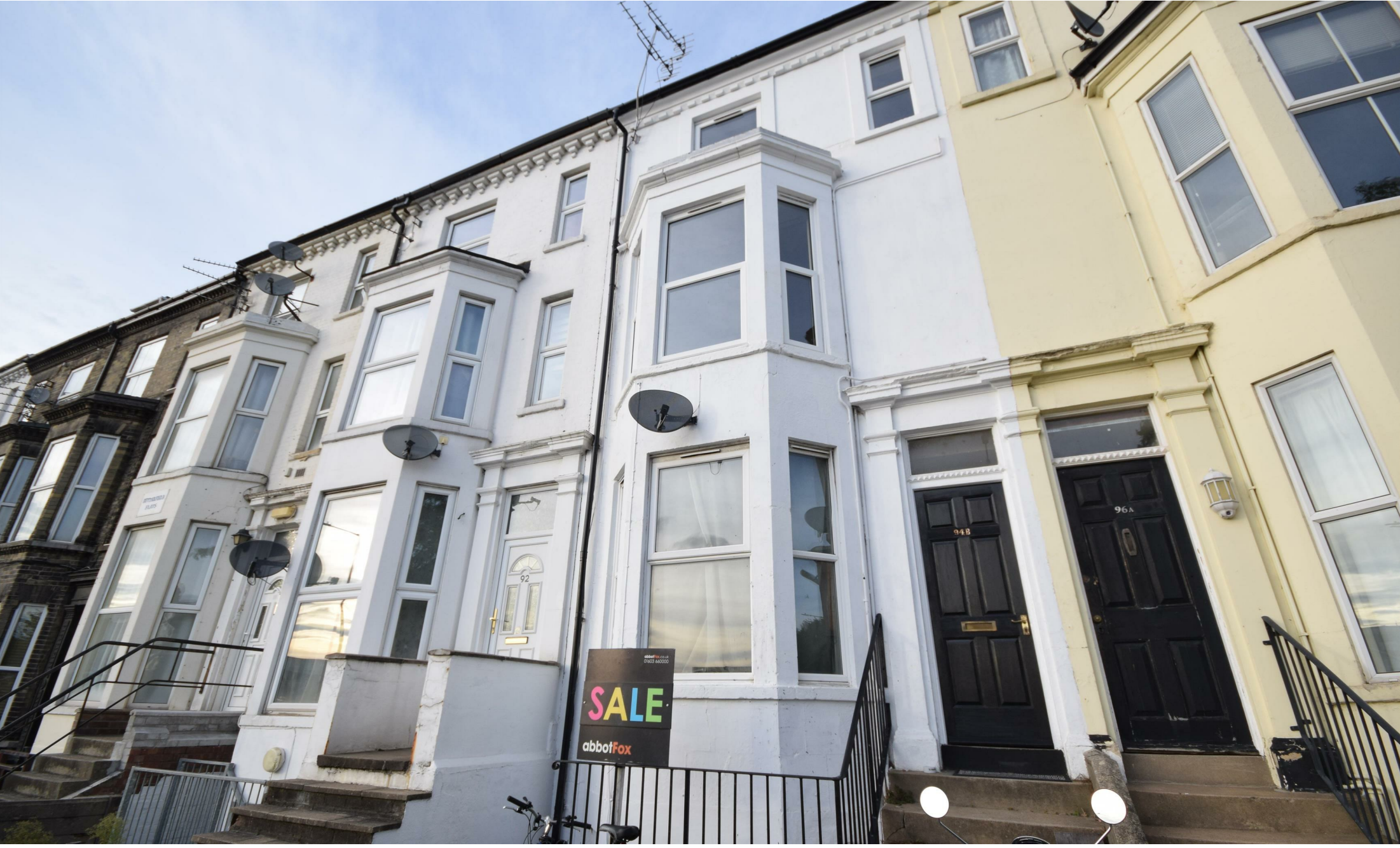
Thorpe Road | Norwich | NR1 Guide £115,000

Disclaimer – In accordance with the Property Misdescriptions Act, the company gives notice that all descriptions, references to condition, necessary permissions for use and other details are given in good faith and believed to be correct, but any intending lessees do not rely on them as statements of fact, but must satisfy themselves by inspection or other means, as to their accuracy.